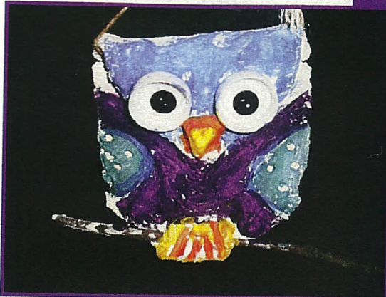
best of show grades K-2 Paulina Esguerra Owl (detail) Clay Deer Run Elementary NFS