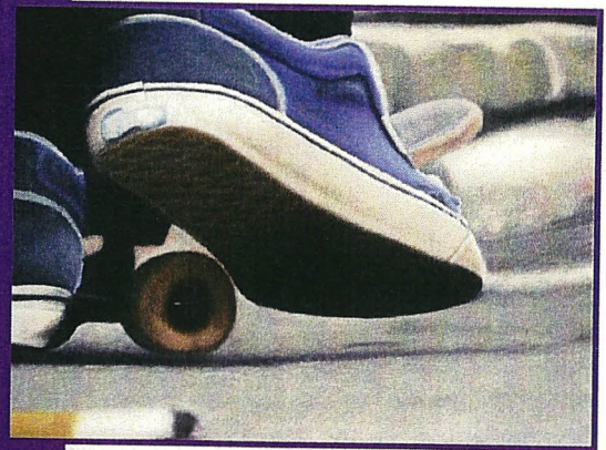
best of show grades 9-12 Patrick Cantwell Break Time (detail) oil pastel on board Dublin Scioto High School NFS

"Red sky at night, sailor's delight – Red sky at morning, sailors take warning."