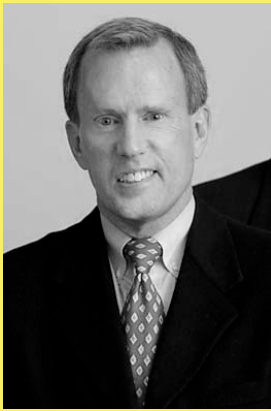
Columbus Academy Class of 1969